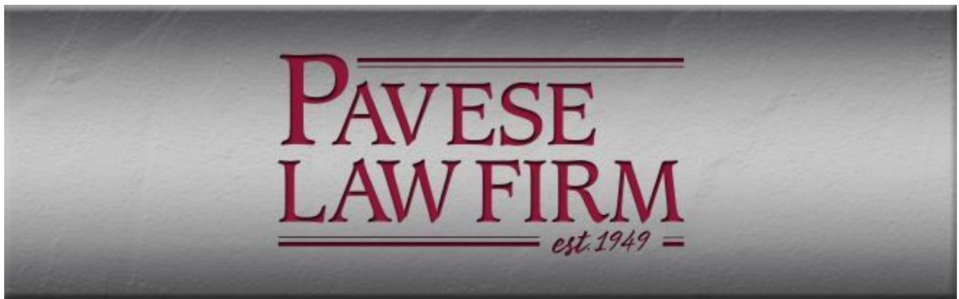
August 17, 2023